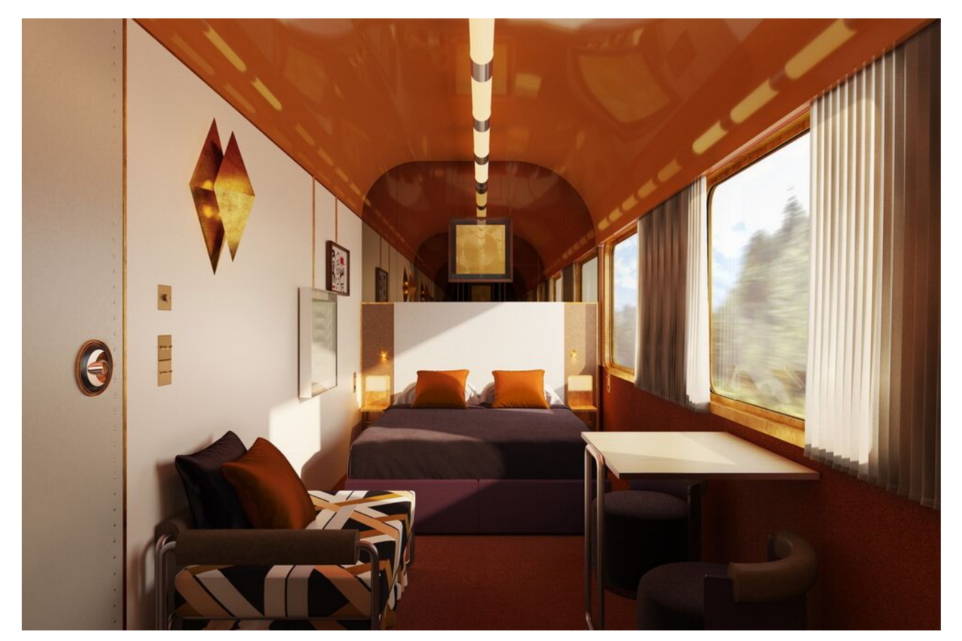
A rendering of a suite cabin on the Orient Express La Dolce Vita Train service. The most exclusive accommodations will cost at least €25,000 per night.